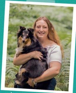
Georgia & Belle

There are no refreshment stops in Piddington, but there is a pub at approx 1 mile in.