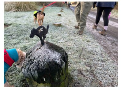
Photo challenge. You will easily spot the first “Dog Poo” sign, but look around and see if you can see a second one.