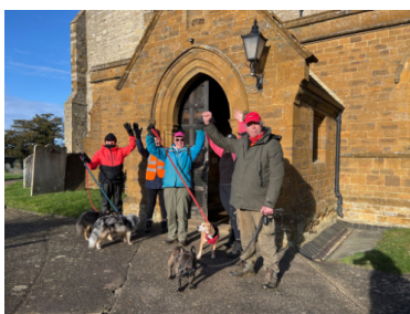
Photo challenge - can you see the beacon? (Placed here for the Jubilee in 2022)

9c. Yey! You made it. We hope you enjoyed your walk today.