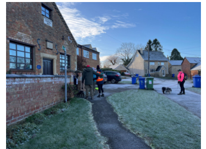
Photo challenge. Did you know that Piddington has a Roman Villa Museum? To find out more click here .

2b. Following the green footpath sign, turn left, over the little bridge. Keep to the path which will lead you through some allotments and emerging at the museum.